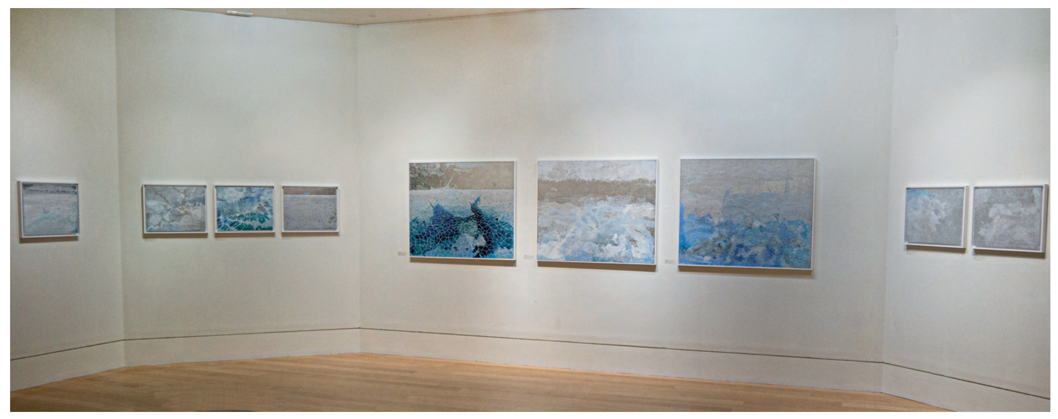
Installation at Royal Scottish Academy, 2022