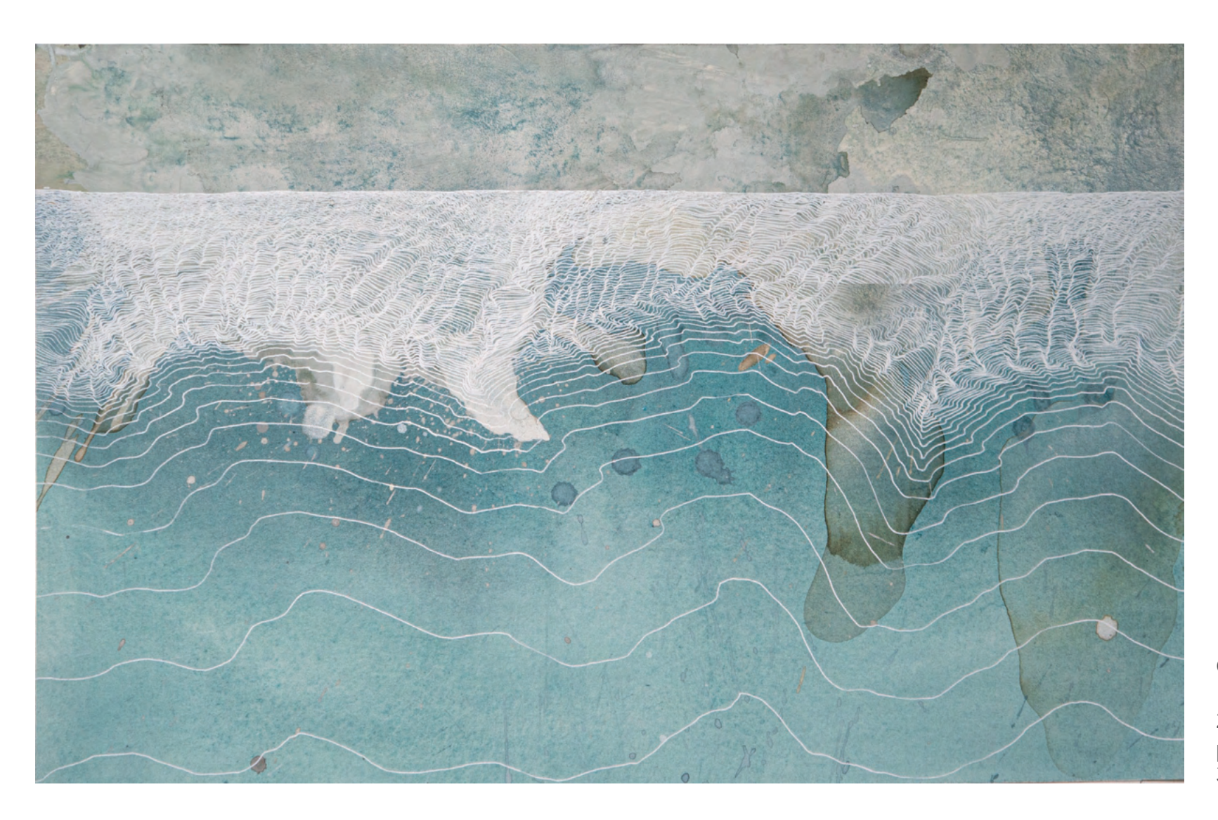
OCEAN OF RAIN

2023, Gouache and pigment ink on paper 34cm x 53cm